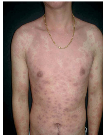
Figure 1. Generalized confluent rash.

We present the case of a 23-year-old man of Chinese origin who attended