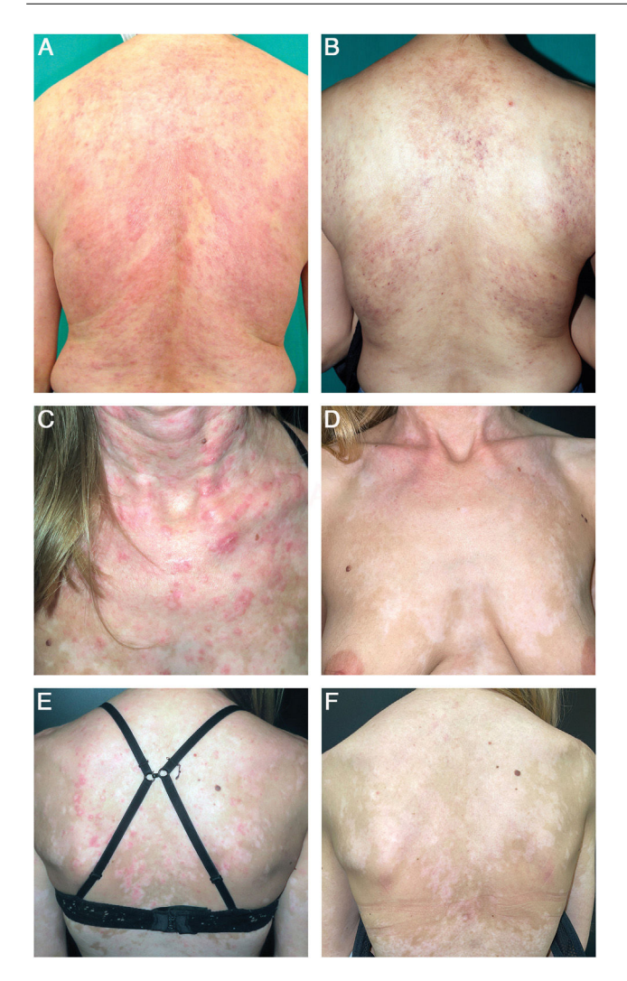
Figure 1 (A) Patient with SCLE lesions on the back. (B) After 16 weeks into anifrolumab treatment, the patient showed no active lesions, only residual poikiloderma. (C and D) Patient with SCLE lesions on her neck, chest, and back. (E and F) After 16 weeks into anifrolumab treatment, the patient maintained a complete response with post-inflammatory hypopigmentation.

a \geq 50% reduction in CLASI-A at 12 weeks (46% vs 24.9%; p = 0.001).<sup>2</sup> However, the cutaneous response was a key secondary endpoint, and no information was provided regarding mucocutaneous involvement characteristics. In the past two years, multiple cases and small case series have been published highlighting anifrolumab effectiveness across a broad spectrum of CLE manifestations.