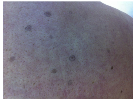
Figure 1 Brown-grey oval macules, slightly palpable, well delimited, 2-to-5mm in diameter, many with collarettes of scale.

Trastuzumab is a monoclonal antibody that binds to the extracellular domain of HER2 and exemestane is an aromatase inhibitor which suppresses plasma oestrogen levels by inhibition of the enzyme aromatase. Acne vulgaris, nail changes, pruritus, leukopenia and more rarely cellulitis, dermal ulcer and erysipela have been described under trastuzumab treatment. Alopecia, dermatitis, itching, acute generalized exanthematous pustulosis, pruritus and urticaria were reported for exemestane. 1