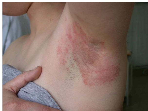
Figure 4 Allergic contact eczema in the armpit caused by a Lyral-containing deodorant.

The cosmetics most closely associated with sensitization to fragrances are perfumes, with leave-on products being more often responsible for allergy to fragrances than