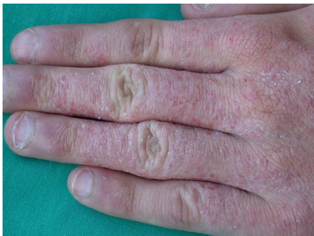
Figure 6 Allergic contact eczema of the hands caused by Kathon CG.

patients who react to MI also reacting to MCI/MI. 59 If sensitization to isothiazolinones is suspected, both the MCI/MI mixture and MI alone should be included in the patch test, because if only MCI/MI is included, approximately 40% of allergies to MI are not diagnosed. This is because the concentration of MI in the Kathon CG patch (25 ppm) is much lower than in the patch with the preservative by itself (75 ppm). 59,62