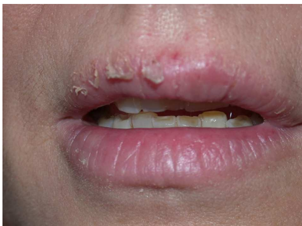
Figure 7 Cheilitis caused by galates present in a lipstick.