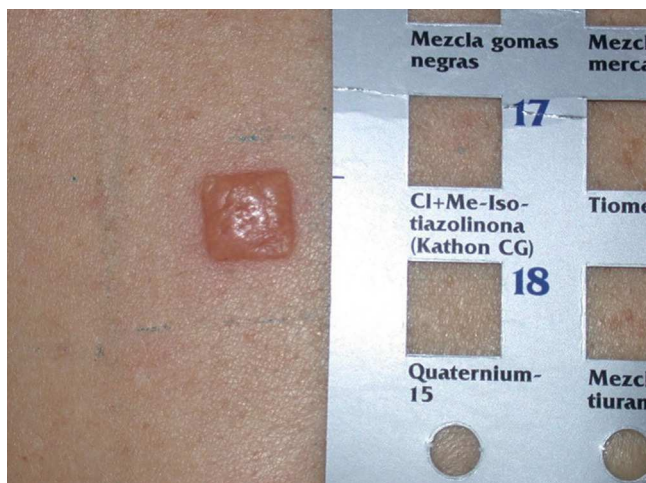
Figure 5 Strong positive reaction in the patch test with Kathon CG.