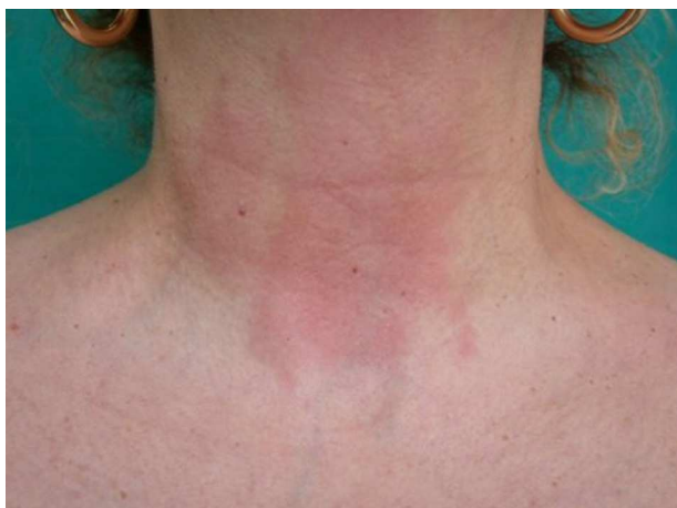
Figure 3 Allergic contact eczema in the anterior cervical region caused by fragrances.