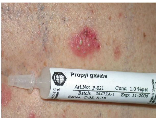
Figure 8 Positive reaction in the patch test with propyl galate.

agents in cosmetics. Some of the more recently identified compounds include dicaprylyl maleate, 23,67 cocamidopropyl betaine (CAPB), 23,64,76,77 ethylhexylglycerin, 23,78 bisdiglyceryl polyacyladipate-2, 79,80 octyldodecyl xyloside, 81 pentylene glycol, 23,82 isononyl isononanoate and trioleyl phosphate, 23,83 kerosene 84 dithiocarbamates, 85 tetrahydroxypropyl ethylenediamine, 86 and copolymers such as C30-38 olefin/isopropyl maleate/maleic anhydride. 87