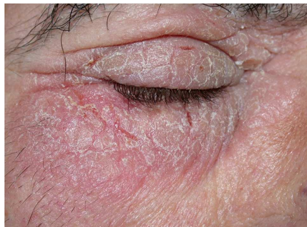
Figure 2 Chronic lichenified eczema of the eyelids caused by cocamidopropyl betaine present in a cosmetic.

of the allergens included in these batteries, Kathon CG (methylchloroisothiazolinone/isothiazolinone) and para-phenylenediamine (PPD) are the most prevalent. 2,5