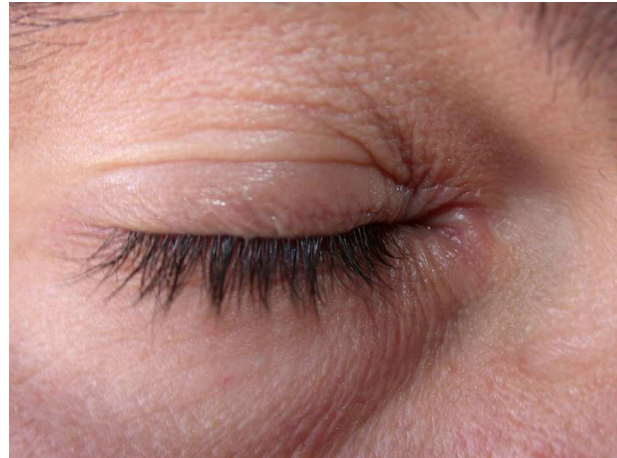
Figure 1 Mild allergic contact eczema of the eyelids after application of a cosmetic product.

Fragrances are the most common cause of allergies to cosmetics, 5,7,9-12 followed by preservatives and hair dyes. 2,5,7-10 Approximately half the positive tests are detected using a standard test battery, 2,13 and