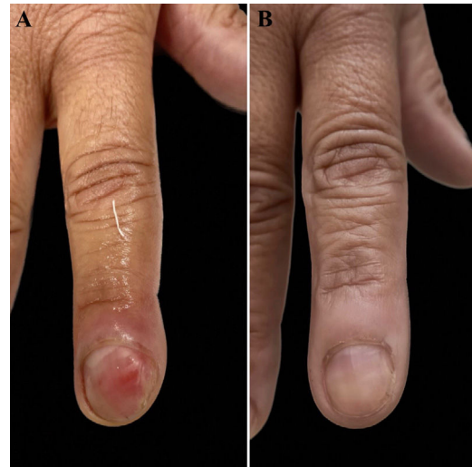
Figure 1 (A) Digital clubbing of right second finger with mild subungual erythema; (B) Same finger 4 months after the procedure.

Subungual excision was performed revealing the presence of a benign mesenchymal neoplasm characterized by a proliferation of typical fibroblasts arranged in a disordered manner, within a loose fibrous stroma with a large amount of mucin, confirmed by colloid iron staining, presenting a myxoid appearance (Fig. 3). The superficial chorion revealed the presence of fibroblast proliferation and thickened collagen fibers forming bundles parallel to the epidermis,