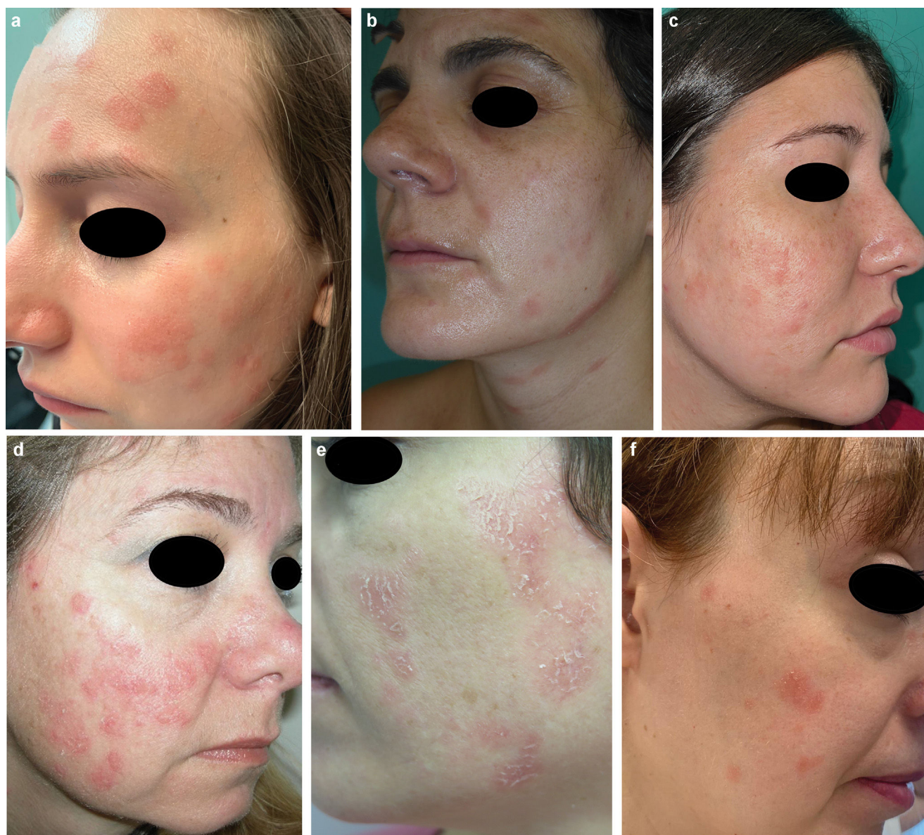
Figure 1 Clinical characteristics. (a–f) Numerous nummular, erythematous-orange papules-plaques with dry scaling on the surface, mainly on the cheeks and forehead in patients #2, #3, #4, #9, #11, and #13, respectively. Presence of cervical lesions in patient #3 (b).

observed. Spongiosis was mild, mainly affecting the lower and middle layers of the epidermis, except for 1 case where it was markedly pronounced. In 2 additional cases, it was associated with lymphocytic exocytosis.