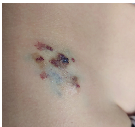
Figure 1 Clinical image. Localized tumor on the right iliac region composed of scattered aggregates of small translucent yellowish, reddish and dark reddish vesicles and papules.

Physical examination revealed the presence of a localized tumor composed of scattered aggregates of small translucent yellowish, reddish, and dark reddish vesicles and papules that occasionally bled and oozed serosanguinous fluid (Fig. 1).