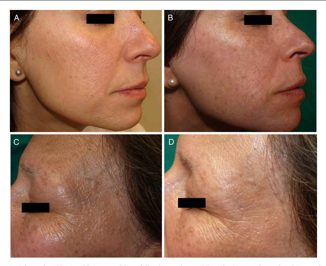
Figure 1 A, Facial papules (FP), in addition to mild perifollicular erythema (PE) with pigmented macules (PM), on the right cheek of Patient 1. B, Patient 1 showing resolution of FP 6 months after starting isotretinoin treatment. C, FP and associated PM on the left temple of Patient 2. D, Patient 2 showing a decrease in the number of lesions 1.5 months after starting isotretinoin treatment.

owing to its potential beneficial effects (described below) and the presence of inflammatory infiltrate involving the pilosebaceous unit. However, its mechanism of action remains unclear. The anti-inflammatory effect at the perifollicular level may account for the decrease in lesion size and the objective improvement in FP. Isotretinoin treatment may