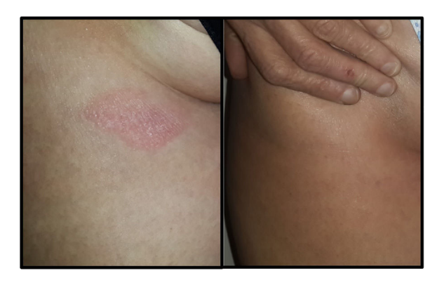
Figure 1 Female patient with plaque stage MF in both legs. Complete resolution of the skin lesions after 60 sessions of UVB-NB therapy.

NB-UVB is an effective therapy to improve life quality and to induce a short-term CR in MF. Our cohort of patients was treated with a twice-weekly schedule, reaching a 80% CR in a mean time of 6.1 months. Hofer et al<sup>7</sup> reported 6 patients treated with NB-UVB 3-4 times-weekly for 5 to 10 weeks, with a mean cumulative dose (CuD) of 16.3 J/cm2. Although 83% of the patients achieved CR, all of them relapsed within 6 months. Gökdemir et al<sup>8</sup> published a prospective study with 23 early-stage MF patients, treated with a thrice-weekly schedule. A CR was achieved in 91.3% patients, the mean CuD was 90.3 J/cm2 with an average of 36 sessions. In the 3-year follow-up period, only one CR patient relapsed. Relapse rate appears to be related to the CuD, rather than to the number of sessions or the schedule applied. However, we also observed a late relapse in 2 patients, which it would suggest that the response variability is still insufficiently understood.