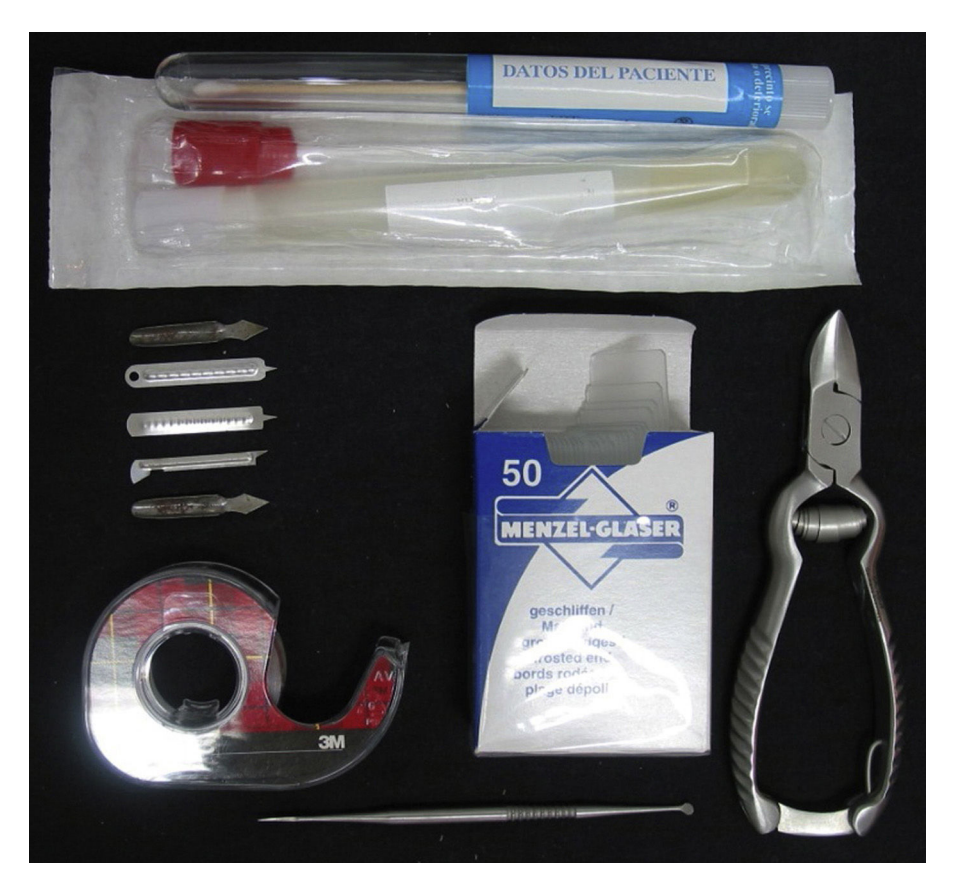
Figure 1 Recommended instruments for taking mycology samples.

though other stains, such as those that combine potassium hydroxide and calcofluor, are also employed.<sup>1,4</sup> The preparation is then covered by a coverslip.<sup>1</sup>