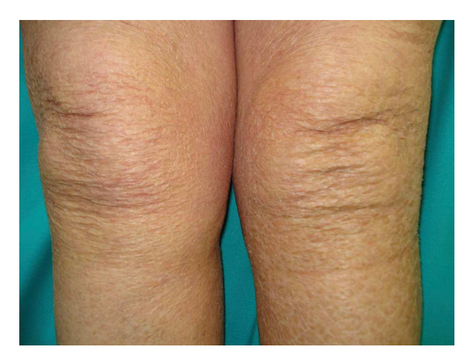
Figure 6 Ichthyosis acquisita.

Ichthyosis acquisita (**) is a more severe form of eczema craquelé characterized by small white or brownish rhomboid scales on the extensor surfaces of the extremities and on the trunk. The palms, soles, and flexures are spared (Figs. 5 and 6). Ichthyosis acquisita is mostly seen