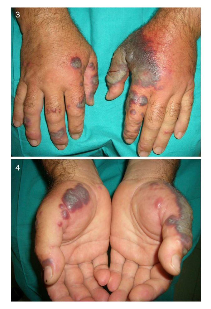
Figures 3 and 4 Sweet syndrome (hemorrhagic lesions on the hands).

elbows, the knees, the feet, and the shoulders. Histologic findings include a histiocytic infiltrate with multinucleated giant cells with an eosinophilic cytoplasm and a ground-glass appearance. Patients also develop destructive symmetric arthritis of the hands and knees. Between 20% and 25% of patients have an associated hematologicl malignancy or breast, stomach, ovarian, or cervical cancer.<sup>3,23-26</sup>