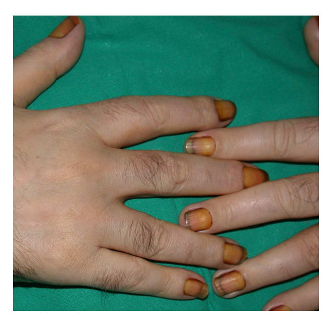
Figure 14 Yellow nail syndrome.

Patients with dyskeratosis congenita have a high risk of aplastic anemia, myelodysplastic syndrome, leukemia, and solid tumors. Leukoplakia, in turn, is associated with a