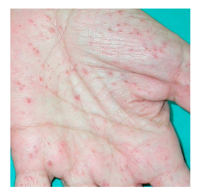
Figure 13 Gorlin syndrome (palmar pits).

<sup>**</sup> Condition occasionally associated with an internal malignancy.