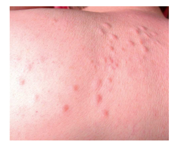
Figure 8 Segmental leiomyomas on the left shoulder.

is associated with carcinomas of the gastrointestinal tract. When there is a single tumor located on the head or neck, it is not usually indicative of malignancy.<sup>29</sup>