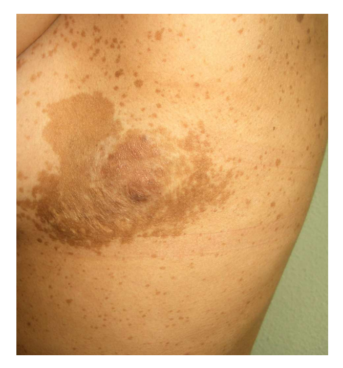
Figure 9 Neurofibromatosis type I (plexiform neurofibroma).

melanoma, intestinal leiomyosarcoma, medulloblastoma, and leukemia. Pheochromocytomas are benign in 90% of cases. There have also been reports of familial early-onset breast cancer and other gynecological tumors.<sup>2,29</sup>