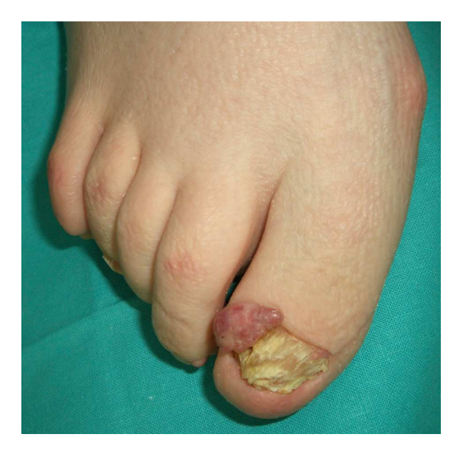
Figure 11 Tuberous sclerosis (Koenen tumor).

with this syndrome may also develop other malignancies such as medulloblastomas, oligodendrogliomas, ovarian fibrosarcoma, and Hodgkin and non-Hodgkin lymphoma.<sup>2</sup>