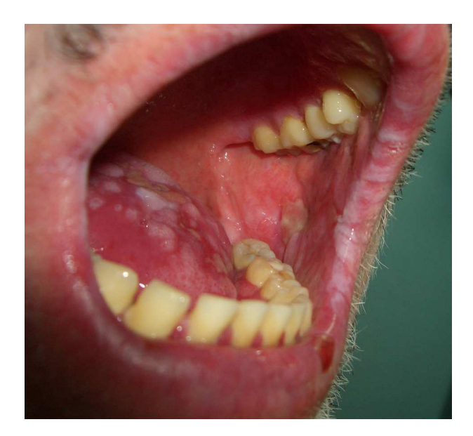
Figure 1 Paraneoplastic pemphigus (erosive lesions on the oral mucosa).

Histologic examination of skin biopsy specimens from patients with paraneoplastic pemphigus shows interface dermatitis, vacuolization of the basement membrane, necrotic keratinocytes, suprabasal clefting, and acantholysis. The lichenoid inflammatory infiltrate may also be