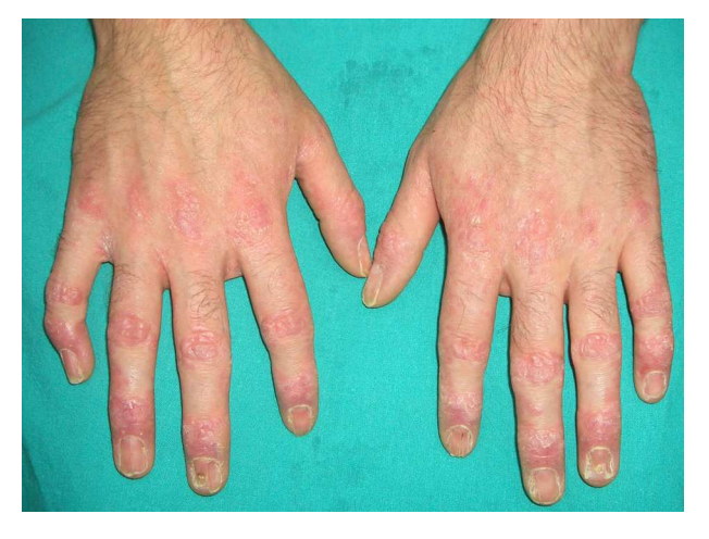
Figure 2 Paraneoplastic pemphigus (lichenoid lesions on the hands and nail dystrophy).

more predominant than in pemphigus vulgaris. Direct immunofluorescence testing reveals immunoglobulin (Ig) G and C3 deposits in intercellular epidermal spaces and at the dermal-epidermal junction, but negative results are also a characteristic feature of paraneoplastic pemphigus.<sup>11</sup> Circulating antiplatelet antibodies are detected in peripheral blood.