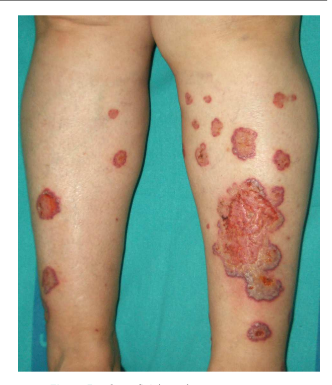
Figure 5 Superficial pyoderma gangrenosum.

Between 10% and 40% of patients with Sweet syndrome have an associated malignancy, which can precede or arise at the same time as the skin lesions. The most common malignancies are acute myeloid leukemia and other hematological disorders. Solid tumors (genitourinary, breast, lung,