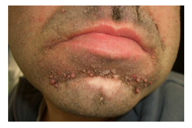
Figure 10 Tuberous sclerosis (facial angiofibromas).

The mouth is the site of many manifestations related to several paraneoplastic signs that have already been discussed (Table 8). These include macroglossia (**) in systemic amyloidosis and myeloma; glossitis (*) in migratory necrolytic erythema and acquired hypertrichosis lanuginosa; erosive lesions in paraneoplastic pemphigus (*); wartlike growths and papillomatosis on the tongue and lips (*) in malignant nigricans acanthosis and cutaneous florid papillomatosis<sup>51</sup>; and mouth ulcers (**) in Sweet syndrome.<sup>55</sup> Oral leukoplakia in dyskeratosis congenita<sup>56</sup> and pachyonychia congenita<sup>57</sup> will be discussed in the following section on nail changes as these are the main manifestations of these conditions.