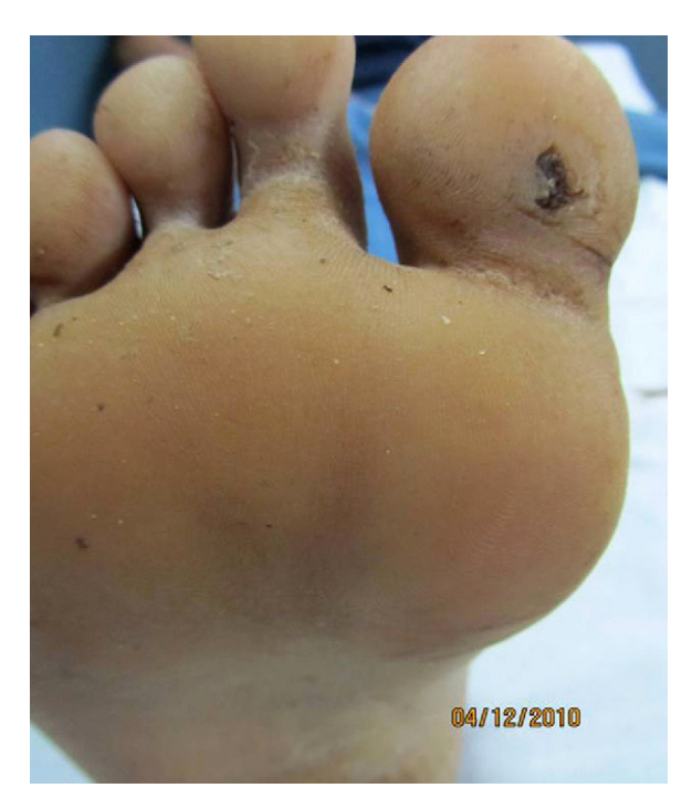
Figure 2 Clinical picture. Small ulcer with smooth borders and a clean base on the plantar surface of the great toe on the right foot.

or after menopause. P brasiliensis has cytoplasmic receptors for 17- \beta -estradiol, a female hormone that inhibits the mycelial-to-yeast transformation, an essential step in the establishment of infection. The age of affected patients