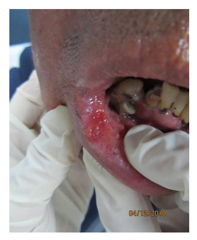
Figure 1 Clinical picture. Multiple spotty erythematous plaques on the lower lip, mulberry-like in appearance.

PCM is a deep mycosis that primarily affects male agricultural workers. The male to female ratio is approximately 9 to 1. In women, the infection occurs before menarche