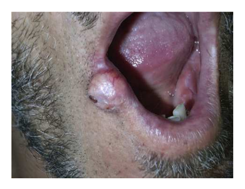
Figure 1 Nodule of 1.5 cm diameter infiltrating the lower lip.

Hematoxylin-eosin staining revealed the presence of lymphoid cell proliferation, consisting mainly of plasma cells