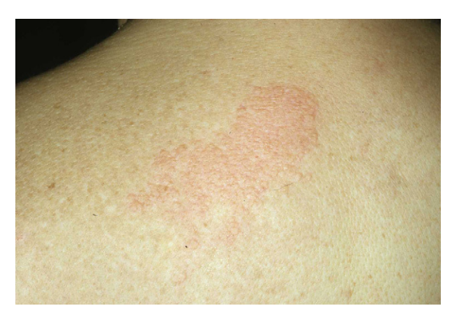
Figure 1 Erythematous papules and plaques on the patient's back.

The patient was diagnosed with sarcoidosis and CREST syndrome (calcinosis, Raynaud phenomenon, esophageal dysmotility, sclerodactyly, and telangiectasia), a type of systemic sclerosis. After treatment with prednisolone (60 mg/d) and nifedipine (10 mg/12 h), the clinical and radiographic aspects of the skin and lung involvement related to sarcoidosis improved. Azathioprine (100 mg/d) was later added to the regimen. The dose of prednisolone