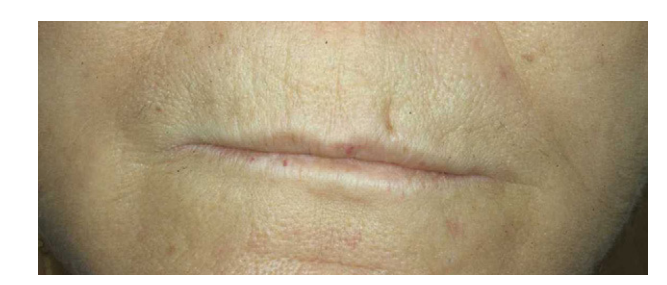
Figure 2 Telangiectasis on the lips.

It is important to emphasize that it can be difficult to differentiate between these 2 diseases because the respiratory manifestations may be similar.<sup>4,6</sup> Skin tests play a crucial role in the diagnosis of both processes. In our patient, histopathologic examination of the skin lesions confirmed sarcoidosis. We found only 1 case of cutaneous sarcoidal granulomas in the literature.<sup>8</sup> In the present case, a thorough examination of the skin revealed systemic sclerosis (CREST syndrome). Whether concomitant sarcoidosis and autoimmune disease is a mere coincidence or the result of a common pathogenic mechanism has not been clearly established.<sup>3-6</sup> Cox et al.<sup>3</sup> and Takahashi et al.<sup>8</sup> suggest that these 2 entities are probably the result of different