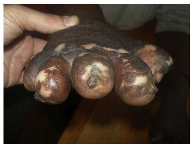
Figure 4 Several of the nail changes that are characteristic of leprosy can be seen in this photograph. Anonychia, spicules, and rudimentary remains of ectopic nails can be seen, and resorption is advanced in a hand that has come to resemble a fin.

Complete absence of the nail, or anonychia (Fig. 6), generally comes with disease progression and may be associated