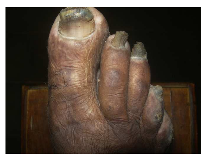
Figure 2 Significantly hypertrophic, hornlike toenail characteristic of onychogryphosis in leprosy.

condition that tends to develop in the presence of onycholysis when there is exposure to moist environments.<sup>34</sup>