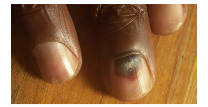
Figure 1 Subungual hematoma at the proximal end of a fingernail.

We should also mention that so-called green nail, denoting a greenish hue from the pyocyanin and pyoverdin synthesized by Pseudomonas aeruginosa organisms, is a