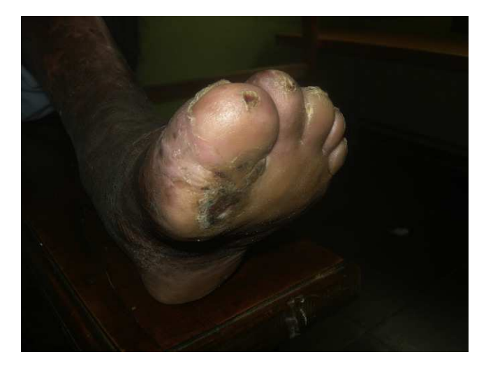
Figure 8 Several perforating ulcers related to leprosy have developed at the tips of the toes photographed.

Pitting, or the presence of small round depressions on the surface of the nail plate, develops because of parakeratosis in the proximal matrix. The distribution pattern may or may not be uniform. Pitting may also be present in psoriasis, alopecia areata, and lichen planus, among other conditions<sup>19</sup> and occurs in up to 4% of patients with leprosy.<sup>22</sup>