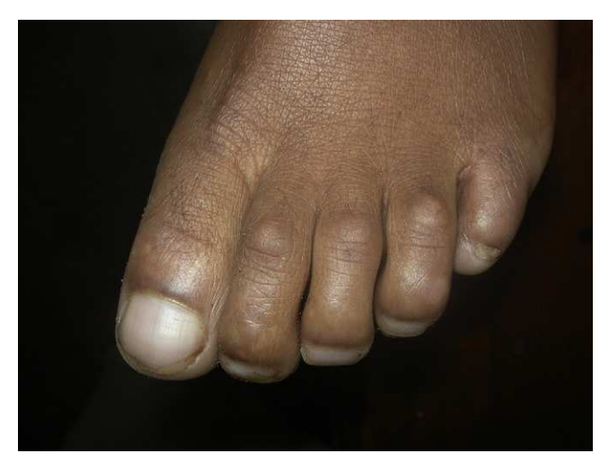
Figure 11 Pallor, in nails with pseudoclubbing.

Although we may think we will rarely or never meet diseases like leprosy in practice, our work as volunteer physicians or providing care for immigrants may well bring us into contact with patients experiencing these problems. At such times, an understanding of nail abnormalities, which are usually only superficially treated in textbooks, will become useful. This review is intended to help practitioners understand and improve the quality of life of these patients.