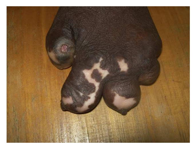
Figure 7 Finlike hand from which fingers have been lost or developed pseudoclubbing and a perforating ulcer on a finger.

In longitudinal melanonychia (Fig. 9), a pigmented band extends from the lunula to the free margin of the nail bed. <sup>50</sup> According to Baran, <sup>51</sup> these melanotic lines appear when melanocytes in the nail matrix are activated by repeated