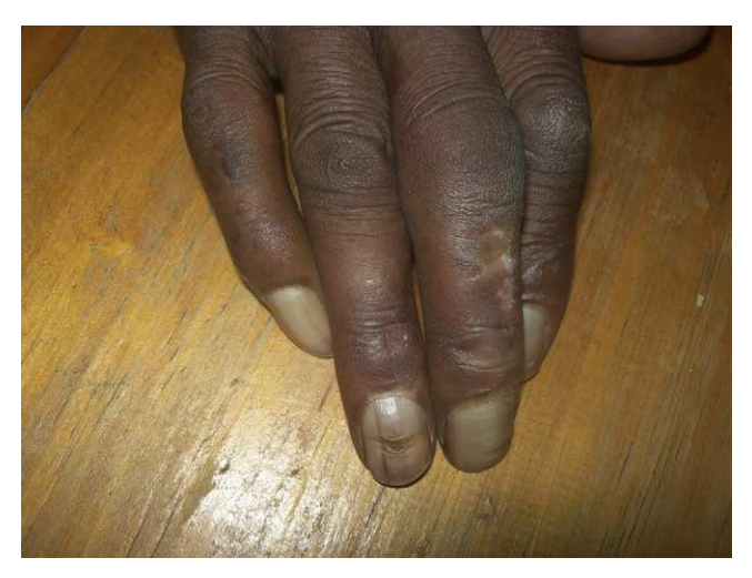
Figure 10 Note the solitary transverse grooves (Beau lines) on a fingernail. Such grooves grow out with the nail.

If the nail plate loses its transparency because of the presence of parakeratosis on the ventral side, the condition is known as true leukonychia. Keratinization of the distal nail matrix is the result of trauma. <sup>17,18</sup>