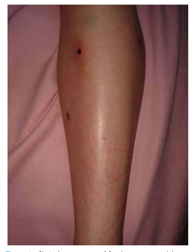
Figure 1 Clinical appearance of 2 subcutaneous nodules on the left leg after the skin biopsies.