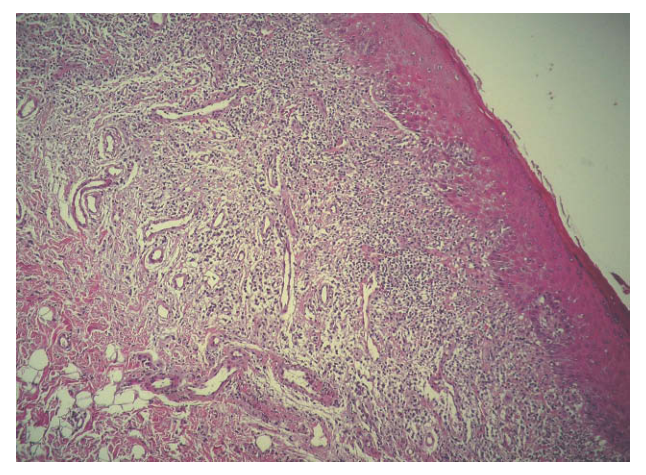
Figure 4. Oral mucosa. Lymphocytic infiltrate in the upper dermis and vacuolar degeneration (hematoxylin–eosin, ×200).

The main symptoms are dysphagia and odynophagia, which present in two thirds of cases.<sup>11</sup> Stenosis is another