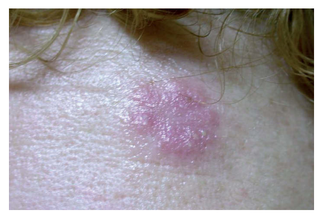
Figure 3. Edematous plaque with a raised edge on the forehead.

54 mm/h. A biopsy revealed a dense polymorphonuclear infiltrate in the dermis with no leukocytoclastic vasculitis (Figure 4). The definitive diagnosis was neutrophilic dermatosis on the dorsa of the hands with distant lesions. Oral prednisone was prescribed at a dose of 1 mg/kg/d and the lesions resolved immediately (Figure 5). The remaining complementary tests—biochemistry, antinuclear antibodies, virus serology, tumor markers, lymphocyte counts, thyroid hormones, and chest radiograph—showed no abnormalities, with the exception of a urine sediment indicating an asymptomatic urinary infection The patient is currently under observation without treatment and, to date, has not had a relapse.