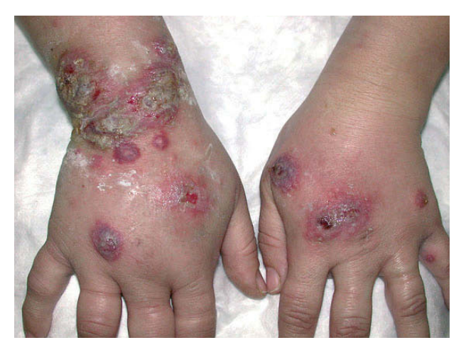
Figure 2. Violaceous nodules with central ulceration and associated edema on both dorsal hands.