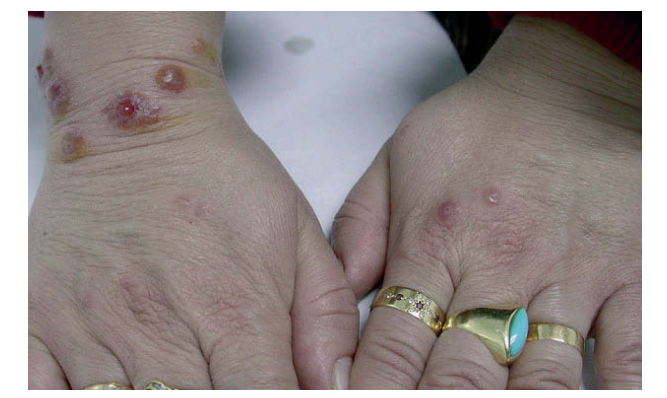
Figure 1. Blood-filled blisters with a linear distribution on the right wrist. Small papulovesicular lesions on both dorsal hands.

was prescribed sulfated water, an oral macrolide, and topical mupirocin. Her symptoms had worsened 48 hours later with the appearance of exudative erosions on the wrist, and violet erythematous pustules and nodules with an edematous border, some of which had central ulceration, on both dorsal hands (Figure 2). She also had an edematous erythematous plaque with a raised edge on the forehead (Figure 3). The patient remained afebrile at all times, was in a good general state of health, and had no associated enlarged lymph nodes or systemic symptoms. The laboratory workup revealed leukocytosis with a cell count of 14 500, a neutrophil count of 10 800, and an erythrocyte sedimentation rate of