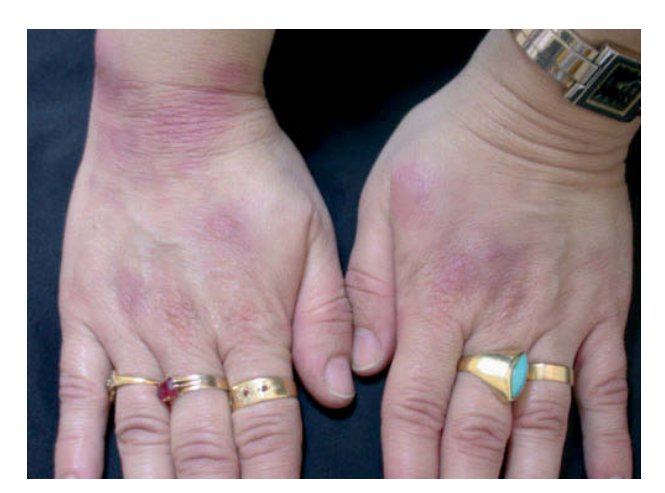
Figure 5. Resolution of the lesions after treatment with systemic corticosteroids.

violaceous erythematous nodular lesions with pustules and blisters in this area. Patients presented with or without associated systemic involvement. Histological examination revealed a dense polymorphonuclear inflammatory infiltrate associated with leukocytoclastic vasculitis. In 2000, Galaria et al<sup>3</sup> presented 3 patients with similar lesions that were refractory to antibiotic therapy and responded well to systemic corticosteroids. Recurrences were treated effectively with dapsone. The histopathological study revealed a polymorphonuclear infiltrate with no leukocytoclastic vasculitis; thus, the authors preferred the term neutrophilic dermatosis of the dorsal hands, suggesting that this could be a local variant of Sweet syndrome or an overlap of Sweet syndrome and pyoderma gangrenosum. Sharareh<sup>4</sup> used the term pyoderma gangrenosum of the dorsal hands to refer to this condition and included it in the atypical manifestations of pyoderma gangrenosum. In their recent review of 52 published cases, Walling et al<sup>1</sup> show that 27% of cases had associated neoplastic disease, 21% of which