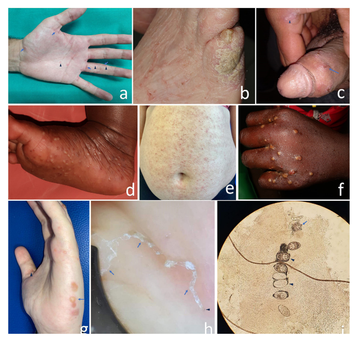
Figure 1 Clinical and microscopic images of scabies; a) classical form in a young adult with skin type 3 exhibiting the characteristic burrows (arrows) and papules (arrowheads) evident at typical locations on the hand; b) crusted or Norwegian form (hyperinfestation) in an elderly bedridden woman with skin type 2, nail abnormalities, and discreet crusted lesions on her pinky finger, posing a challenge for diagnosis; c) genital nodules and erosions (arrow) and burrow (arrowhead) in a young man with skin type 5; d) infantile acropustulosis, pustules on the sole of a 3-month-old baby with skin type 6; e) atypical form with disseminated eczematous lesions (abdomen shown) in a middle-aged woman with skin type 3; f) classic impetiginized form, pustules in typical scabies location on the hand of an 8-year-old girl with skin type 6; g) blistering atypical form, with blisters on the side of the hand (arrow) and a burrow on the thumb (arrowhead) in a young woman with skin type 3; h) image of the burrow obtained using a manual dermatoscope. At one end, the dark triangle consistent with the anterior section of the mite can be seen (arrowhead). The sinuous linear path starting here ends in a triangular image (arrows). These structures make up the ''delta wing sign''; i) image of the mite (arrow) and its eggs (arrowheads) obtained through optical microscopy of scraping of one of the burrows.

Pruritus prevents rest and, along with the stigma associated with the disease, causes significant psychological distress.<sup>58</sup>