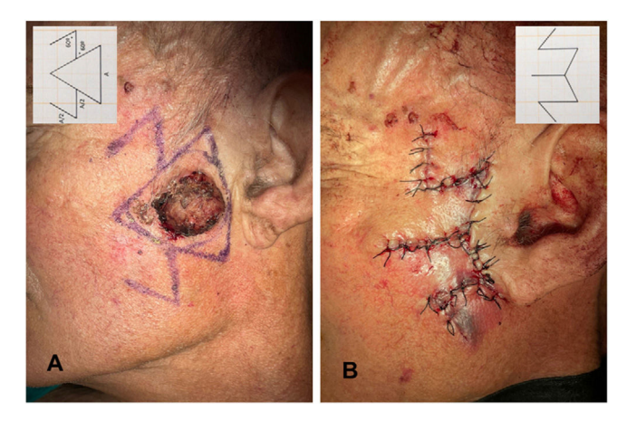
Figure 2 Spider crab flap. A, Design of the lateral transposition flaps at the lower left vertex of the triangle. The angles and measurements of the flap are shown in the inset (upper left). B, Outcome. Diagram showing the scar after suture (inset, upper right).

Figure 1 Design of the spider crab flap on pig skin. A, The 2 lateral transposition flaps, which represent the arms of the crab, are traced from the central point of the sides of the triangle. These lateral flaps measure half the length (a/2) of the base of the triangle (a), with an angle of 60° (black spots). B, Excision of the triangle representing the surgical defect and dissection of both flaps. C, Central point of suture, which starts at the base of the triangular defect and passes through the internal vertices of the lateral flaps. D, Closure of the defect with the single central stitch. E, Outcome after complete suture of the flap.