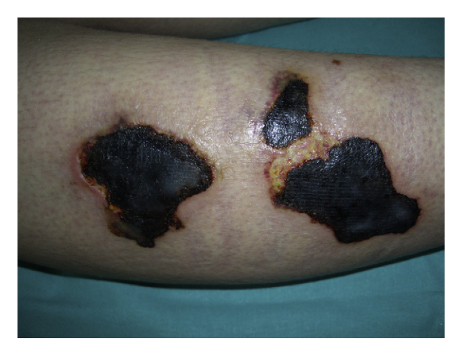
Figure 2 Cutaneous lesions on day 7 of hospitalization. Extensive cutaneous necrosis on the right leg.