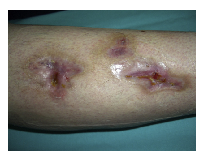
Figure 4 Cutaneous lesions after 3 months. Residual scarring visible on the leg.

Only 23 cases of extensive cutaneous necrosis linked to APS have been reported in the literature. 1,8 Most of the patients have been young women and the underlying diseases included SLE (9 cases), lupus-like disease (1 case), urinary tract infection (2 cases), acquired immunodeficiency syndrome (1 case), rheumatoid arthritis (1 case), mycosis fungoides (1 case), and mixed connective tissue disease (7 cases). Seven patients had no underlying disease. All of the patients developed thrombotic complications limited to skin, and, as in our patient, the lower limbs were the most commonly affected site. Skin biopsy revealed the presence of thrombi in dermal venules and capillaries, with no evidence of vasculitis.